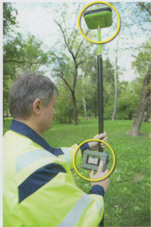
TRIUMPH-1M + Victor-LS