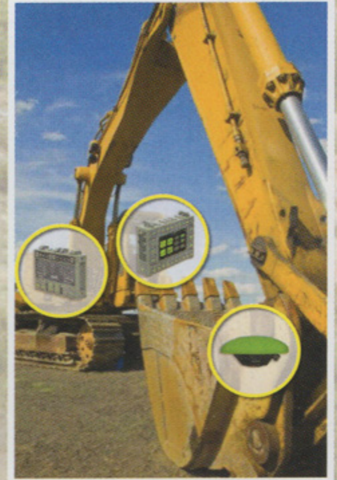
OMEGA + Victor-LS + GrAnt

Not only the best RTK Systems, they all can also be used as base stations and any other applications.