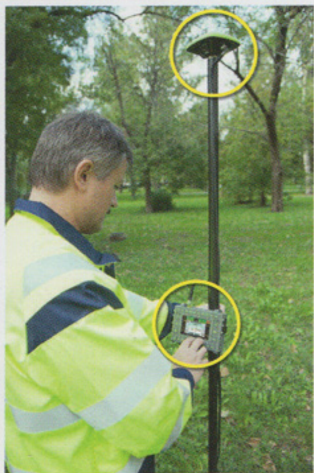
TRIUMPH-NT + GrAnt