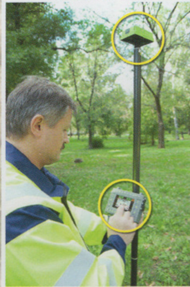
TRIUMPH-2 + Victor-LS