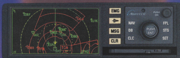
Ashtech ALTAIR™ AV-12 GPS Receiver

Unique color moving map displays aircraft position, plus aircraft warning flags (TCA, ARSA, MOA, Prohibited and Restricted Areas).