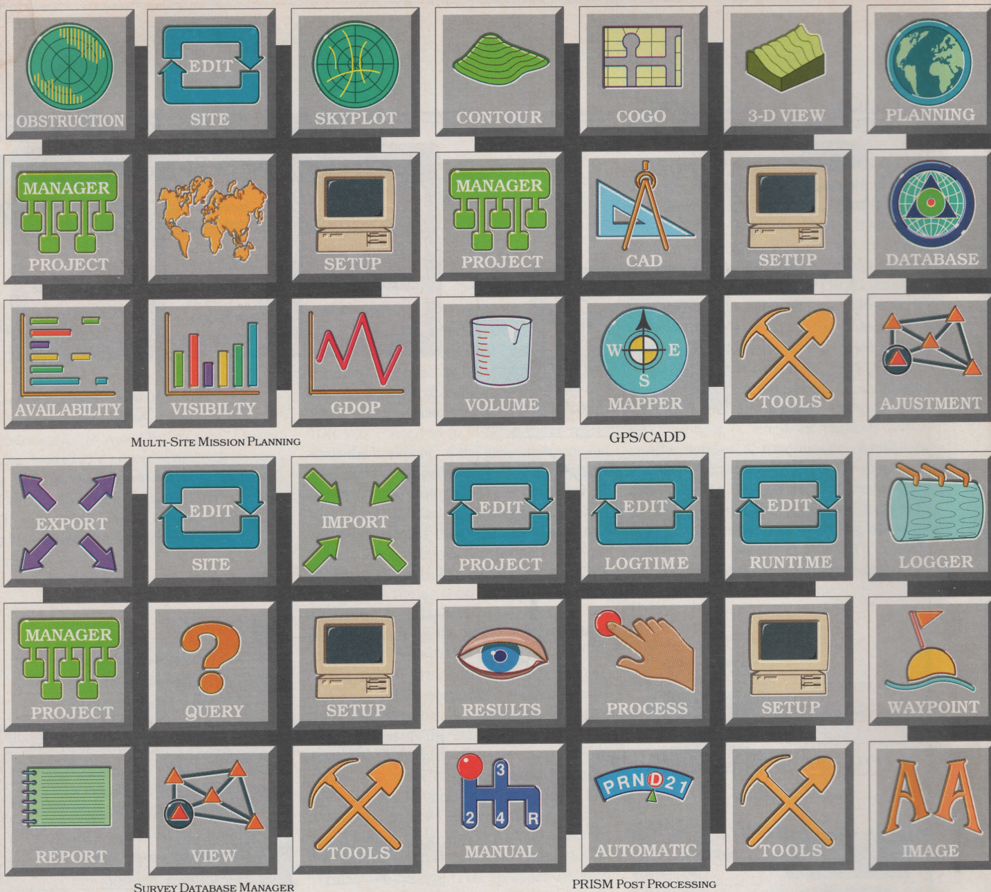
MULTI-SITE MISSION PLANNING