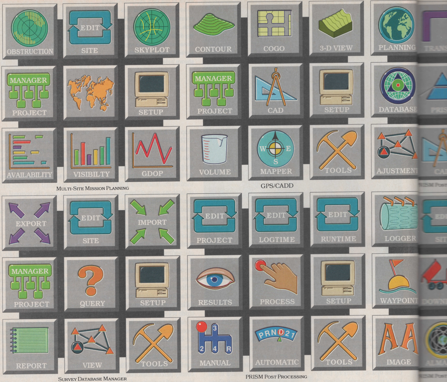
MULTI-SITE MISSION PLANNING