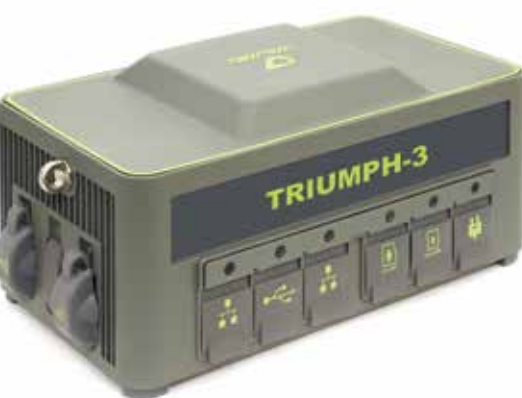
Ideal as a base station

The TRIUMPH-3 receiver can operate as a portable base station for Real-time Kinematic (RTK) applications or as a receiver for post-processing, and as a scientific station collecting information for individual studies, such as ionosphere monitoring and the like.