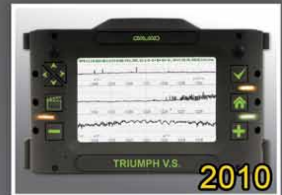
GNSS Spectrum Analyzer in TRIUMPH-VS